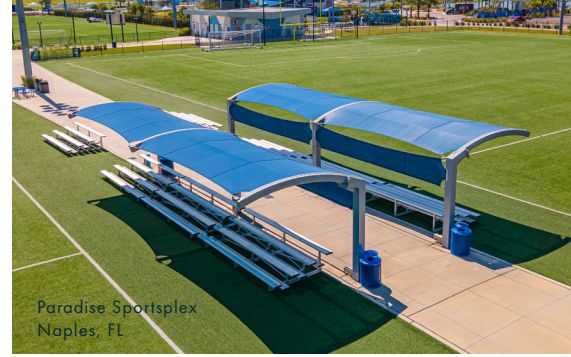
Paradise Sportsplex Naples, FL

With our carefully curated selection of quick ship units, you can confidently plan your projects, knowing that your desired products will be in your hands within a short time frame.