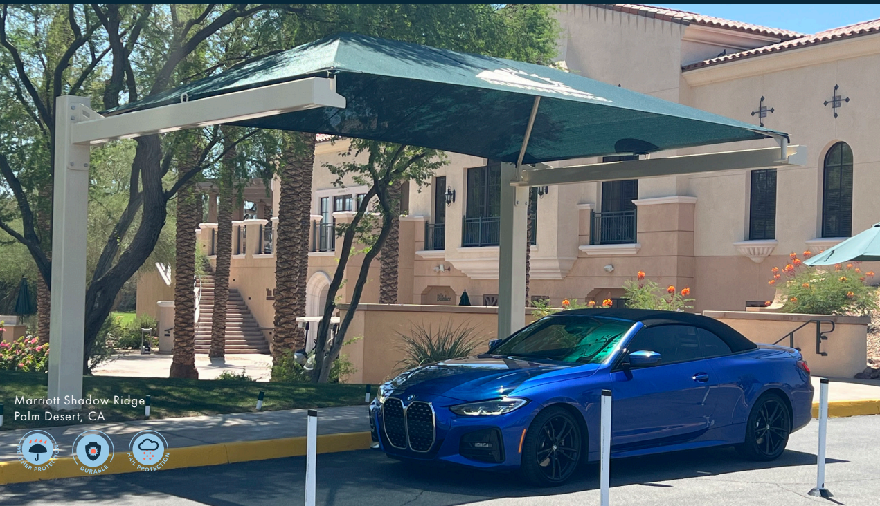
Marriott Shadow Ridge Palm Desert, CA

Scan to customize your favorite standard structure.