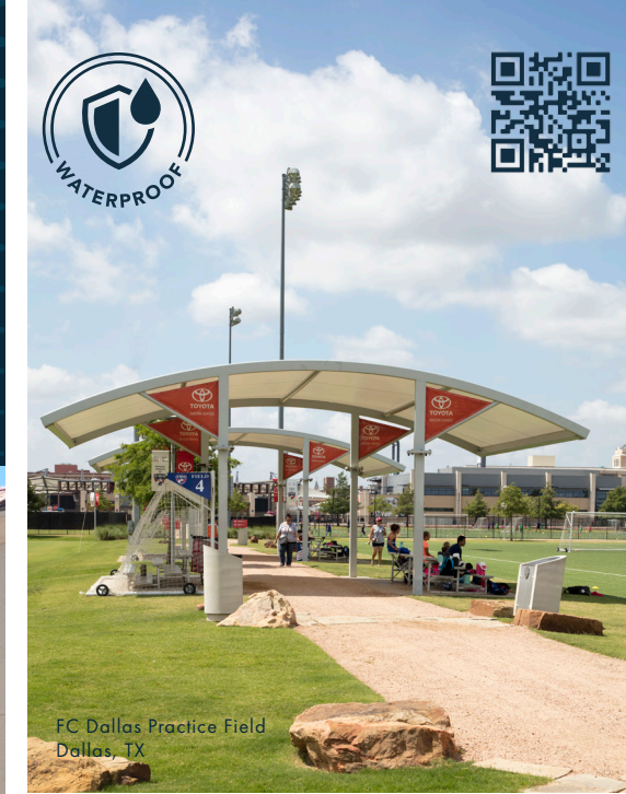
FC Dallas Practice Field Dallas, TX

We offer various fabrics to fit your shade structure needs including Waterproof. These sustainable membranes include Novashield®, PVC and PTFE which have the capability to withstand heavier loads.